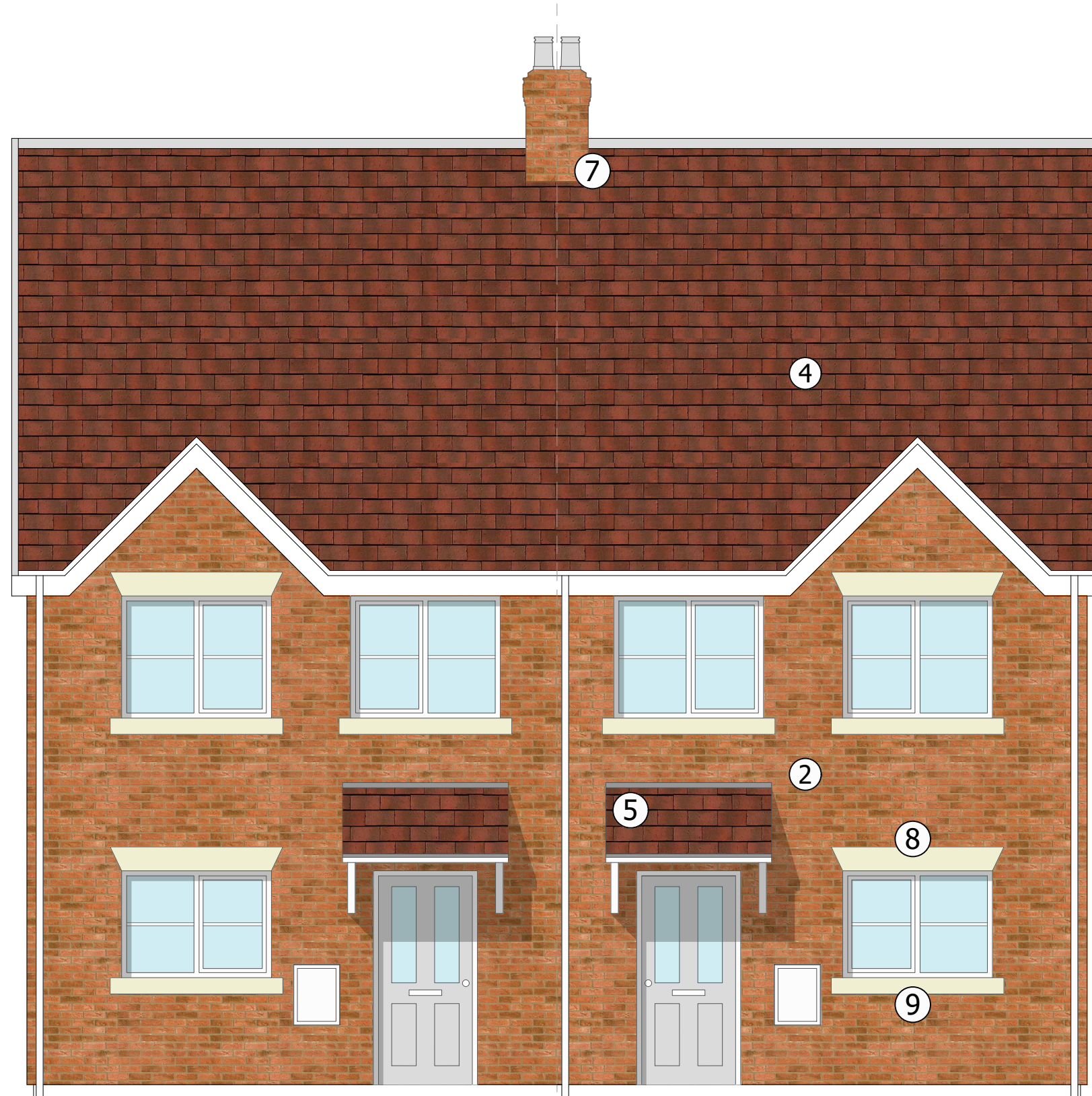
Type 3Bed Front Elevation Plots 21-22