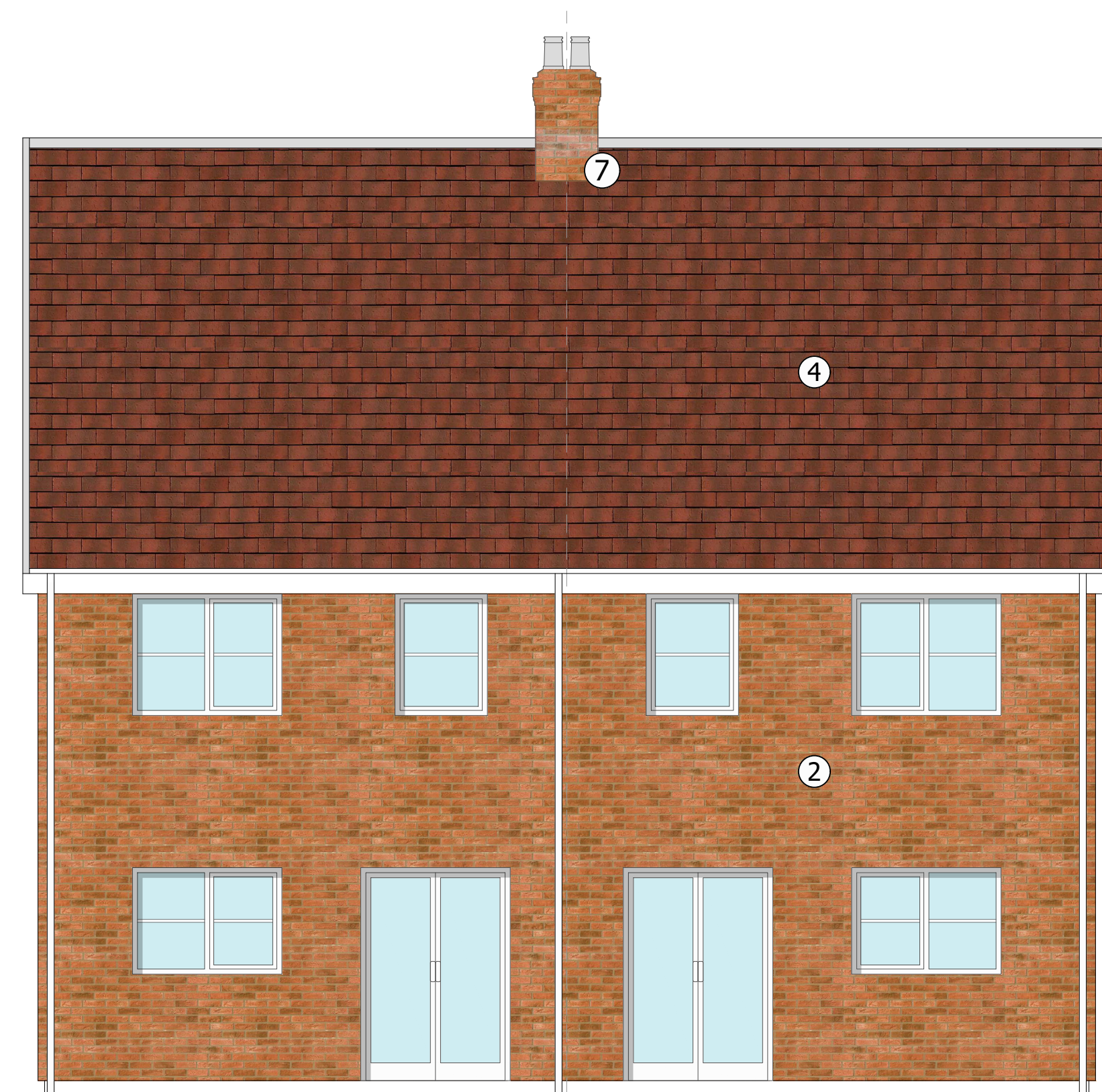
Type 3Bed Rear Elevation Plots 21-22