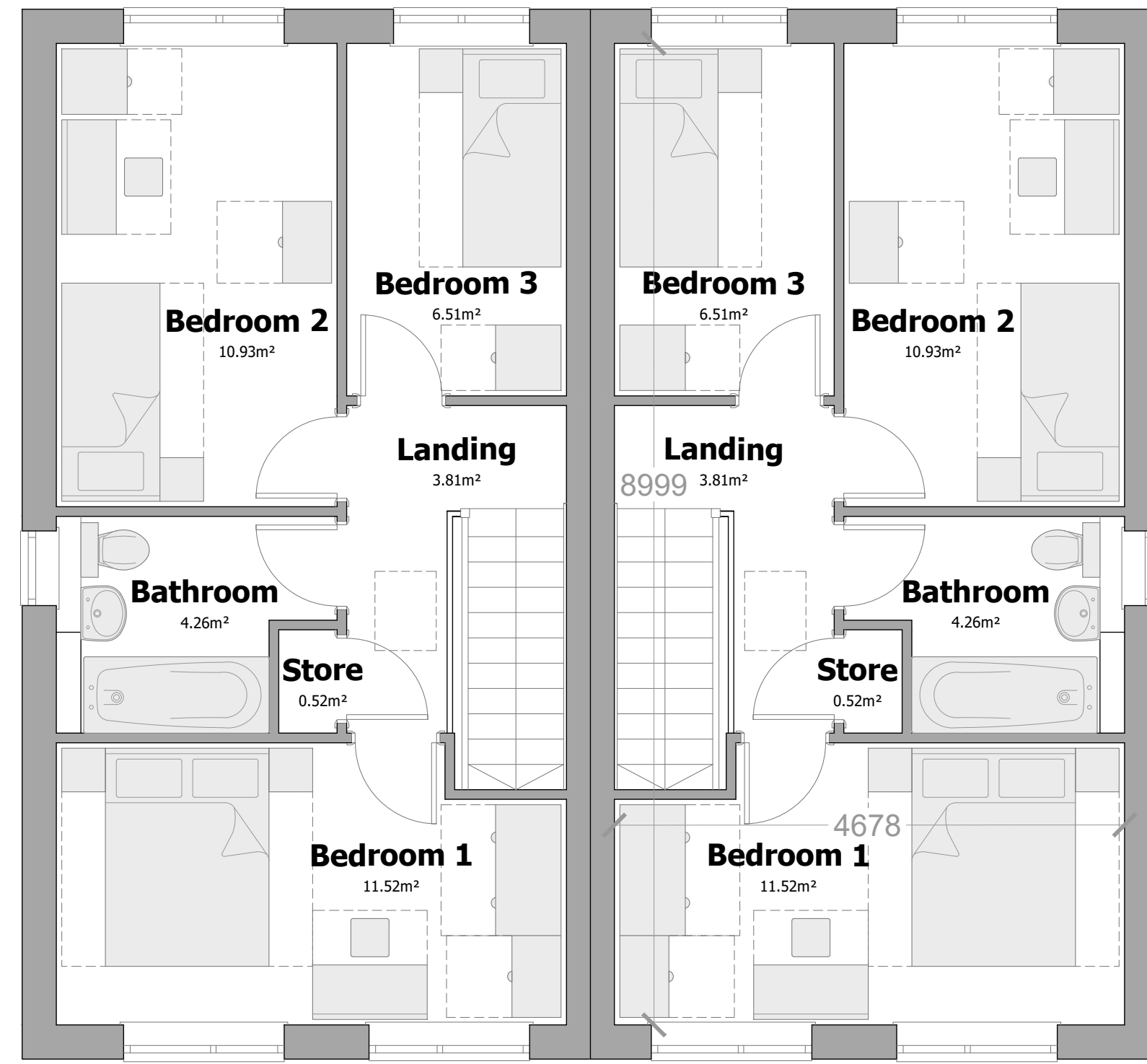
Type B 3Bed First Floor Plan